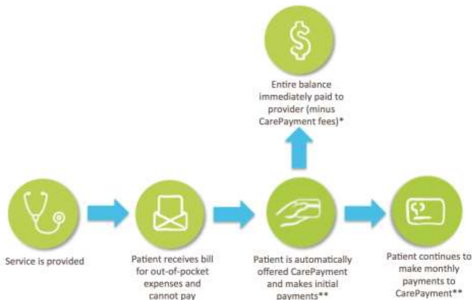
Figure 3: The CarePayment Model: Post-Service Offer

* Some configurations include immediate funding to provider for high-propensity-to-pay accounts prior to initial patient payments.