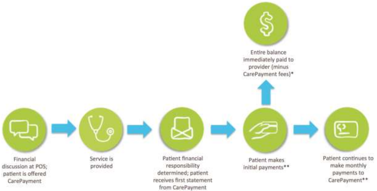
Figure 2. The CarePayment Model: Point-of-Service Offer

fees to CP, and are responsible for reimbursing CP for accounts that are returned to the hospital for patient non-payment. CP services are also available to physician groups and other medical providers; in March 2015, CP was available at over 700 hospital facilities and physician clinics nationwide.